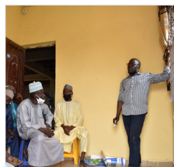
Investing in Communities

The U.S. African Development Foundation (USADF) is an independent U.S. government agency established by Congress to invest in African grassroots organizations, entrepreneurs, and SMEs. USADF's investments promote local economic development by increasing incomes, revenues, and jobs. Utilizing a community-led development approach, USADF provides seed capital and local project management assistance to African-owned and -led enterprises addressing some of Africa's biggest challenges around food insecurity, insufficient energy access, and unemployment—particularly among women and youth. Over the last five years (2016–2020), throughout Africa's Horn, Sahel, and Great Lakes regions, USADF has invested more than US$117 million dollars directly into over 1,000 African-owned and -operated entities and impacted over four million lives.